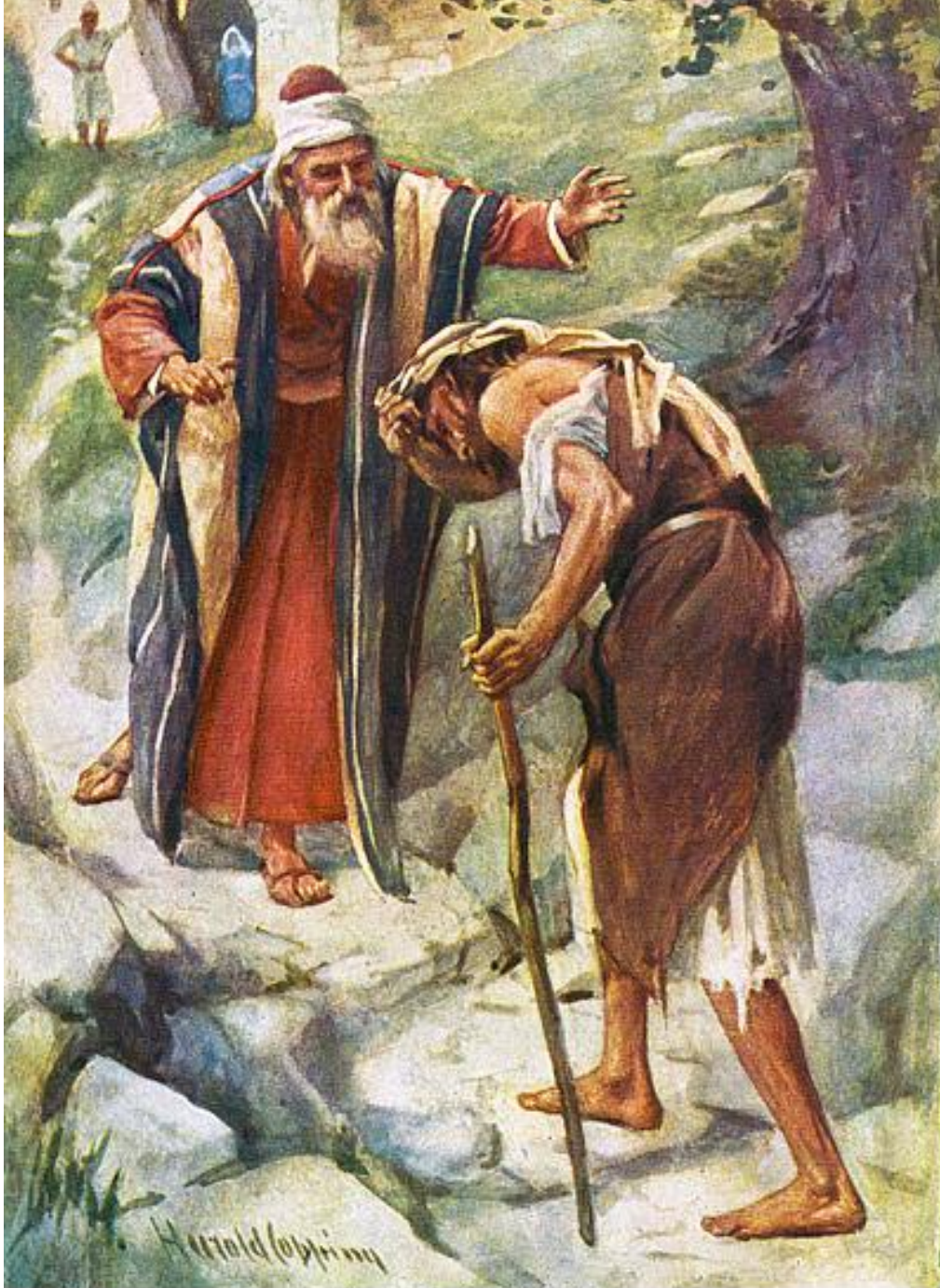
The Prodigal Son by Harold Copping